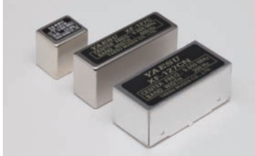
300 Hz, 600 Hz, 3 kHz Crystal roofing Filters

The Down conversion 9 MHz 1st IF frequency receiver construction, can realize narrow 300 Hz (optional), 600 Hz and 3 kHz bandwidth roofing filters. Implementing the extra sharp Crystal Roofing Filters provides superior close-in dynamic range and affords the best receiver performance possible.