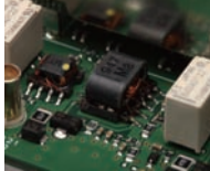
RF amp with the large size wide range transformer

The essential elements in receiver performance are the RF amplifier and the 1st mixer. YAESU pursued the ultimate performance of these circuits. The RF amplifier has optimized NF points, and the over-sized wide range RF transformer exhibits minimum saturation in strong signal processing. The optimized devices were selected to guarantee superior multi-signal RX performance. The desired maximum performance has been realized in the development of the FTDX3000 receiver circuitry. The FTDX3000 has the high dynamic range IP3 performance that was realized and proven in the FTDX5000.