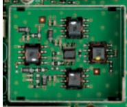
The 1st mixer that provides optimum reception performance