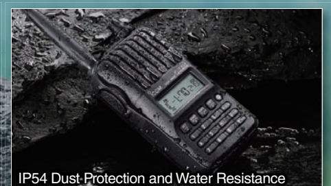
IP54 Dust Protection and Water Resistance