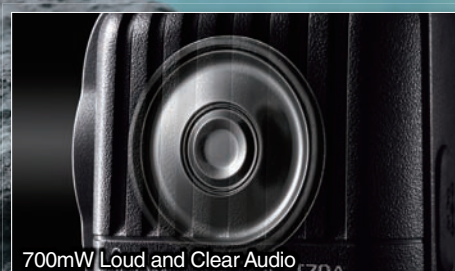
700mW Loud and Clear Audio